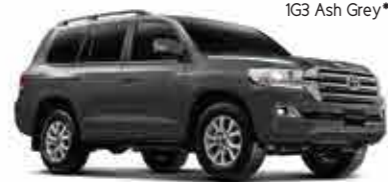
1G3 Ash Grey*