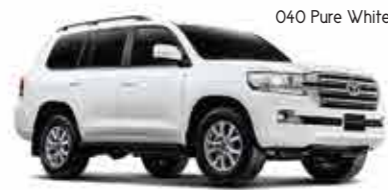
040 Pure White