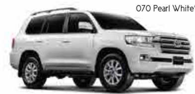
070 Pearl White*