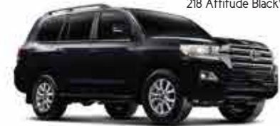
218 Attitude Black*