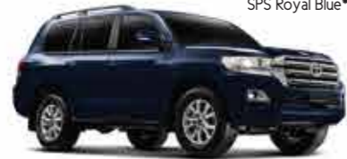
SPS Royal Blue*