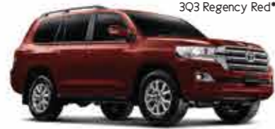
303 Regency Red*