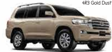
4R3 Gold Dust*