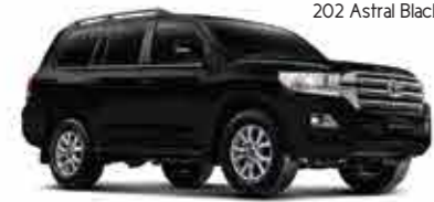
202 Astral Black