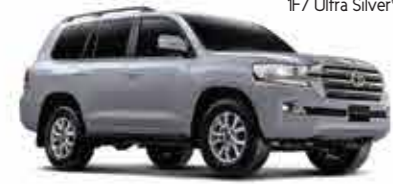
1F7 Ultra Silver*