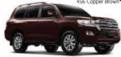
4S6 Copper Brown*